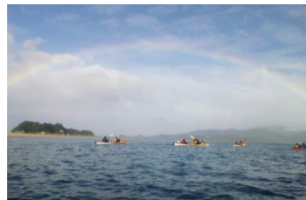
Kayaking in the Abel Tasman

Adventure Tourism: Students were faced with a cold, wet and challenging week recently when they took to the sea for the kayaking component of this programme. However, the Trades Academy crew took this all in their stride, wrapped up warmly and went out in search of rainbows. Good on you - we admire your mahi, your can-do attitude and your fortitude!